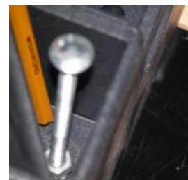
Carriage bolt assembly inserted through right pocket hole into mounting plate.

The right front edge of the DustSucker&More!™ (see arrow to the left) can be used as a starter pin or fulcrum pin when using router bits with a bearing to guide the wood. The purpose of a starter pin is to reduce or prevent kick back from the router bit during the initial contact. You insert a 1/4" diameter carriage bolt (not provided) into the hole in the right front pocket to engage a hole drilled in your router mounting plate. Once you insert the bolt the DustSucker&More!™ can