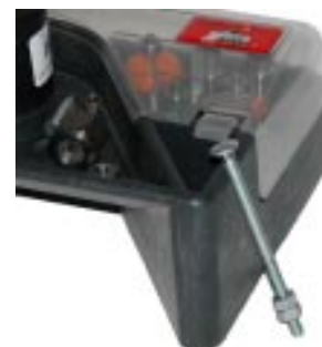
Carriage bolt and jam nuts.

You will find that the FulcrumEdge™ absorbs almost all of the impact of the initial contact with the router bit. After cutting starts use the bearing on the router bit to continue the cutting.