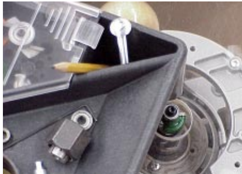
FulcrumEdge™ sits behind bearing

To locate and to drill the 1/4" diameter hole: (1) unplug the router; (2) place the DustSucker&More!™ on the router table as shown in photos so that your largest diameter router bit does not contact the DustSucker&More!™ and with the FulcrumEdge™ sitting slightly behind the bearing; (3) put a 1/4" diameter drill bit (not provided) into the hole in the right pocket and tap it lightly with a hammer to mark where to drill the hole; (4) drill the 1/4" diameter hole where you marked; (5) put two nuts on a 4" long 1/4" diameter carriage bolt (nuts & bolt not provided) and tighten them together so about 3/4" of the carriage bolt extends below the bottom of the jam nuts; (6) insert jam nut assembly through the DustSucker&More!™ in the right pocket hole and into the hole you drilled into the mounting plate. Now can use the right edge as a FulcrumEdge™.