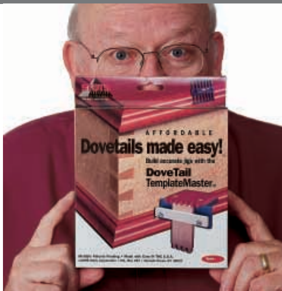
Dovetails Made Easy! Easiest to use most versatile and least expensive dovetail jig in the World