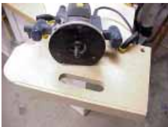
Handle cut in lap bench with pattern bit and router. Location not critical.

I made this bench from a piece of 1/2" thick birch plywood scrap. MDF is another excellent choice of material.