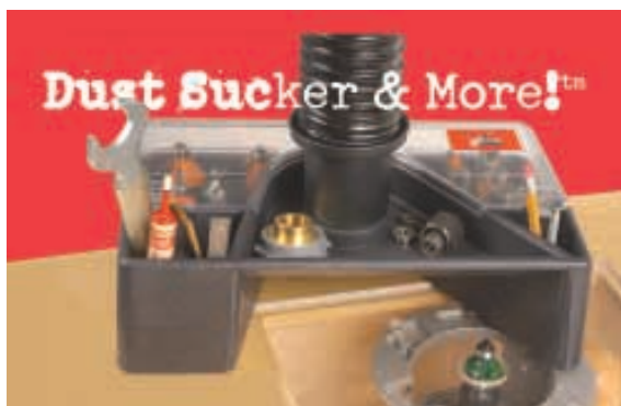
Your answer to router table: Dust collection Router bit storage Frustration of losing tools

All tools made in the USA and guaranteed for five years