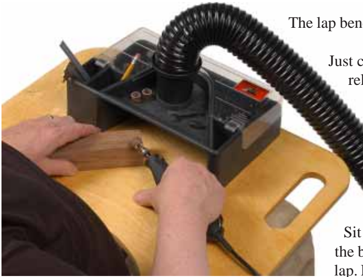
Lap bench with a DustSucker&More!™ screwed in place. The DustSucker&More!™ tames the mess generated when carving or sanding.

The lap bench is extremely easy to make and to use.