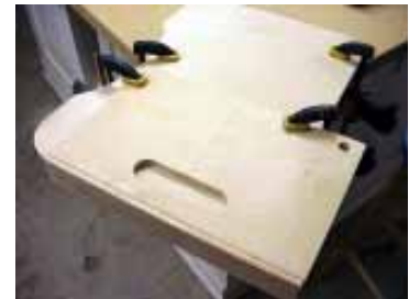
Handle jig clamped in place.

Sit down and place the bench on your lap. Place a DustSucker&More!™ where it is most convenient for you