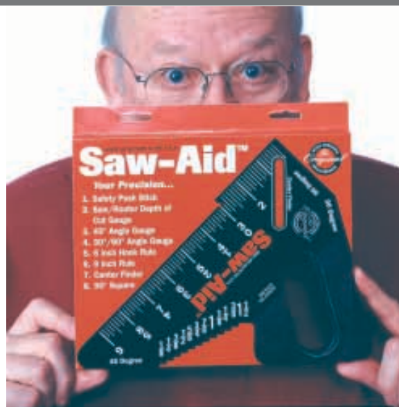
Swiss Army Knife of Pushsticks!